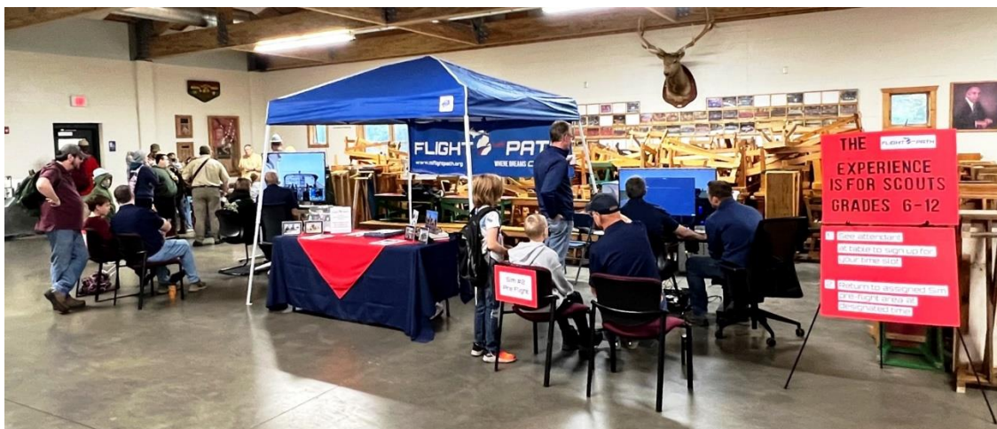
Flight Path brought two X-Plane Flight Simulators to the Scout Outing