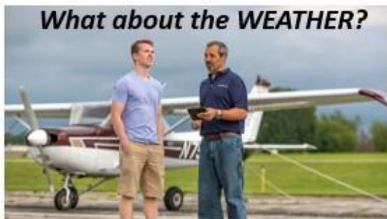
What about the WEATHER?