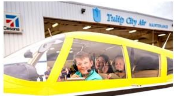
Get in the plane